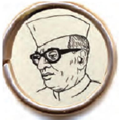
Kanhaiyalal Maniklal Munshi

(1887-1971) born: Gujarat. Advocate, historian and linguist. Congress leader and Gandhian. Later: Minister in the Union Cabinet. Founder of the Swatantra Party.