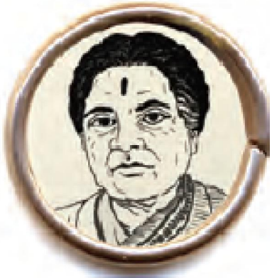
G. Durgabai Deshmukh