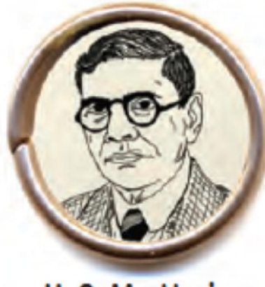
H. C. Mookherjee

Later: Defence Minister in the Union Cabinet.