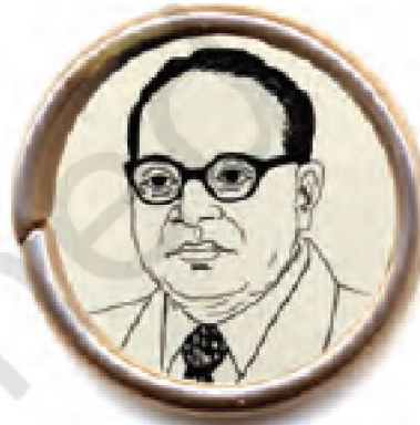
Bhimrao Ramji Ambedkar

(1887-1971) born: Gujarat. Advocate, historian and linguist. Congress leader and Gandhian. Later: Minister in the Union Cabinet. Founder of the Swatantra Party.