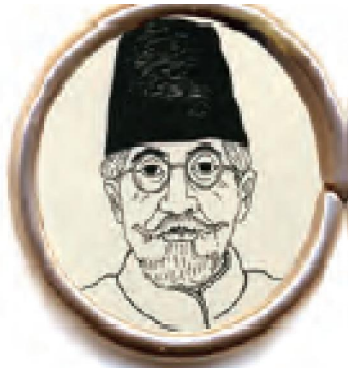
Abul Kalam Azad

(1875-1950) born: Gujarat. Minister of Home, Information and Broadcasting in the Interim Government. Lawyer and leader of Bardoli peasant satyagraha. Played a decisive role in the integration of the Indian princely states. Later: Deputy Prime Minister.