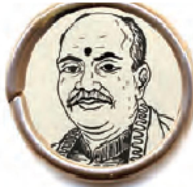
Shyama Prasad Mukherjee

(1891-1956) born: Madhya Pradesh. Chairman of the Drafting Committee. Social revolutionary thinker and agitator against caste divisions and caste based inequalities. Later: Law minister in the first cabinet of post-independence India. Founder of Republican Party of India.