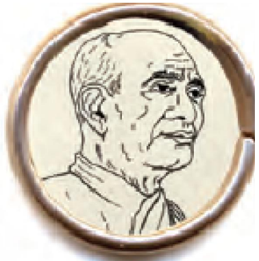
Vallabhbhai Jhaverbhai Patel

(1875-1950) born: Gujarat. Minister of Home, Information and Broadcasting in the Interim Government. Lawyer and leader of Bardoli peasant satyagraha. Played a decisive role in the integration of the Indian princely states. Later: Deputy Prime Minister.